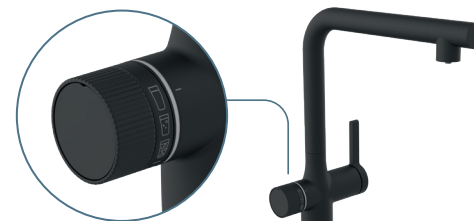
Matt black, Art. 99960