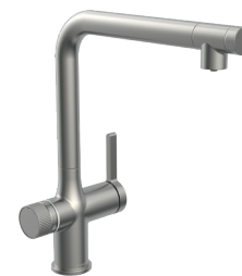
Stainless steel, Art. 99905