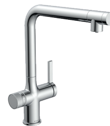
Chrome, Art. 99900

Elegant and timeless design combined with the latest technology. The AQUASTAR PREMIUM is available in the trendy colours chrome, stainless steel and matt black.